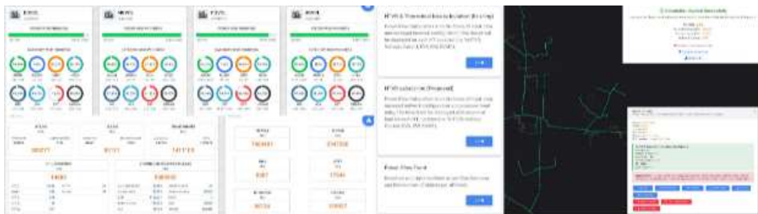
Figure 2: DISCOM Asset information and electrical Network study portal