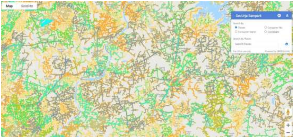
Figure 3: GeoUrja Sampark portal for customer care