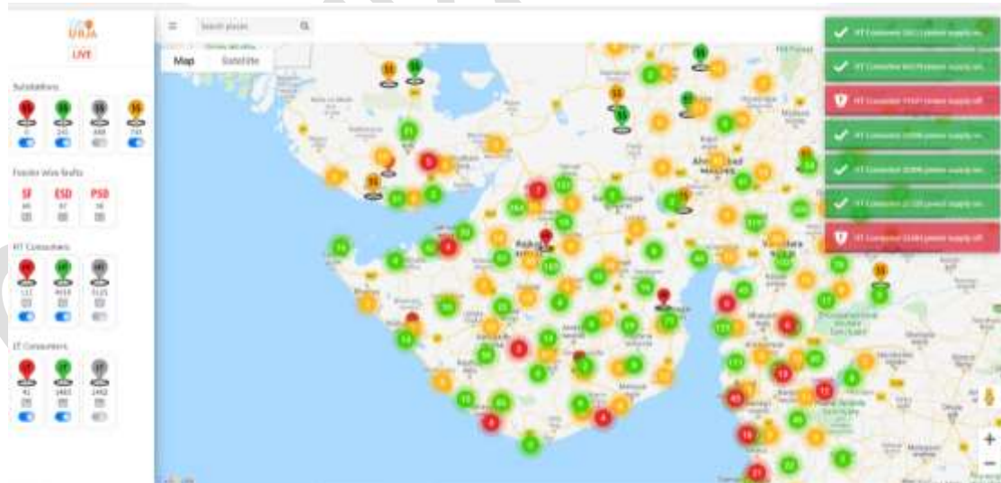
Figure 4 : Network outages and live power status of consumers

The Unique and Innovative Dashboard is designed to know the live power supply status of feeders and consumers. The various integration of existing systems elements such as information of feeder circuit breakers, RMUs, Meter Modem, Switches, etc are carried out and plotted on a single platform with GIS Power Network. The real-time Power supply status of the Consumers and ongoing network outage informations entails to access Power reliability and is also helpful for utility to manage the power flow of the network.